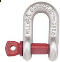
G-210 / S-210

G-210 Screw pin chain shackles meet the performance requirements of Federal Specification RR-C-271F, Type IVB, Grade A, Class 2, except for those provisions required of the contractor. For additional information, see page 444.