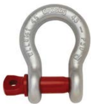
G-209 / S-209

G-209 Screw pin anchor shackles meet the performance requirements of Federal Specification RR-C-271F Type IVA, Grade A, Class 2, except for those provisions required of the contractor. For additional information, see page 444.